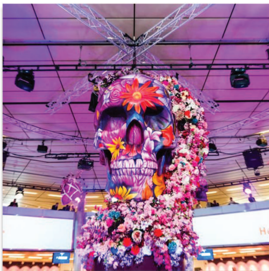
ECR 2017 concept: the Flower Gardens of Radiology