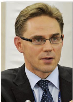
Dr. Jyrki Katainen - EU Commission Vice President (left)

In particular, the event promoted the Investment Plan for Europe and the European Fund for Strategic Investments (EFSI), as an effective financial instrument to support European health systems' reforms and other necessary investments in the health sector.