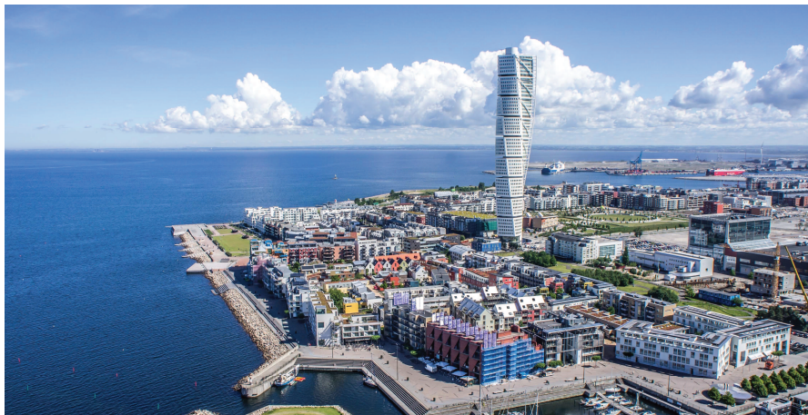
Malmö, venue of the next meeting with delegates (left)

An important shared aim of the new Bureau is to further enhance the already excellent relations with the most relevant European institutions and scientific societies, in particular with the European Board of Neuroradiology (EBNR), the European Society of Neuroradiology (ESNR), the European Society of Radiology (ESR) and the European Society of Minimally Invasive Neurological Therapy (ESMINT).