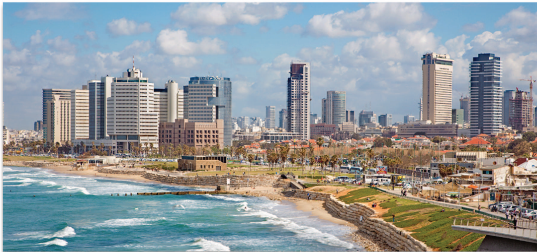
Tel Aviv seaside promenade

UEMS Spring Council Meeting will take place in Tel Aviv on Thursday, 27 th and Friday, 28 th April 2017.