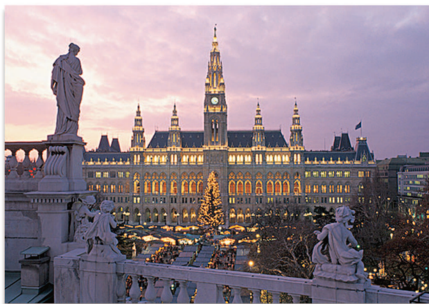
Vienna - The Rathaus