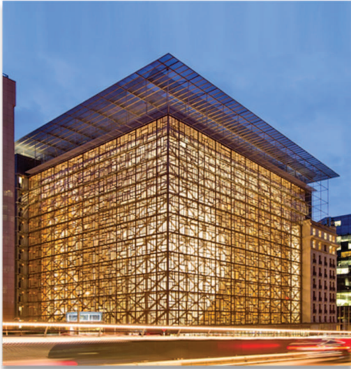
The newly inaugurated Europa Building in Brussels

Furthermore, E-health plays a central role in Malta's agenda, as the country traditionally hosts the e-health week in Valletta. M-health, e-health and the new apps that are coming up are changing the