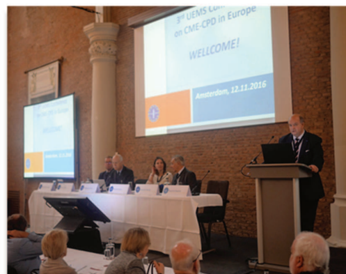
CME conference in Amsterdam

whose implementation will start in January 2017, giving an overview of the most important activities and innovations, and informing about general principles and rules of the EACCME system.